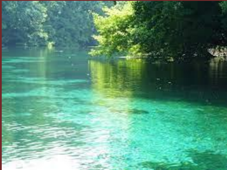
Ohrid Lake springs